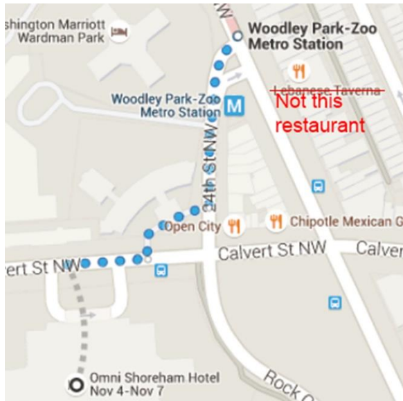
Hotel to Woodley Park-Zoo Station